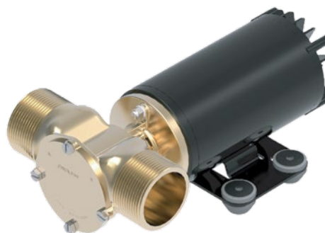
Talulah HP Ballast Pump