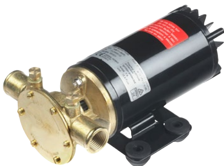
Talulah Ballast Pump