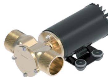
Talulah HF Ballast Pump